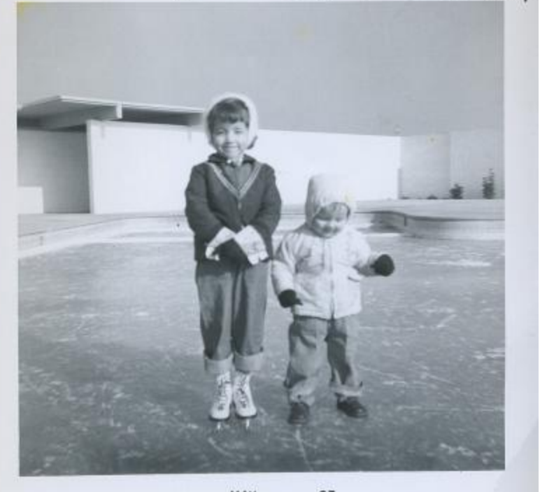
MAY • 63