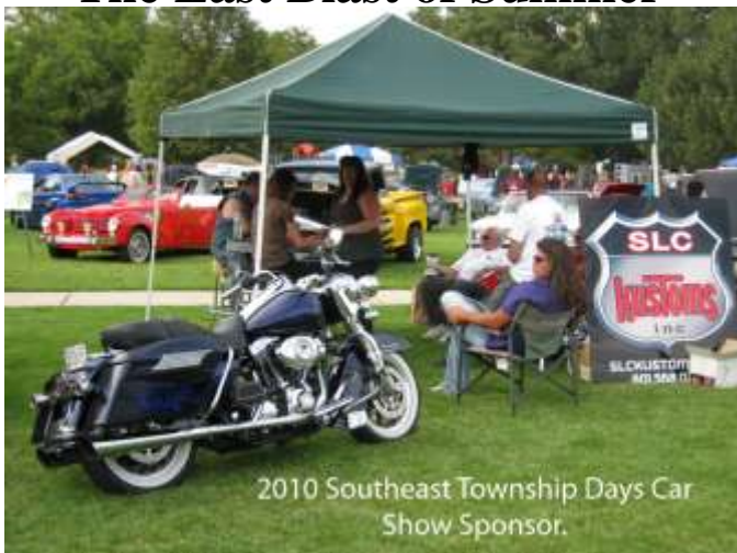
2010 Southeast Township Days Car Show Sponsor.