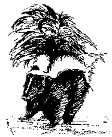
Figure 1. A striped skunk in a defense stance, and ready to spray.

Skunks disrupt unsecured garbage cans and consume pet food that is left outdoors. They may also damage lawns, athletic fields, and golf courses by digging up turf as they search for food.