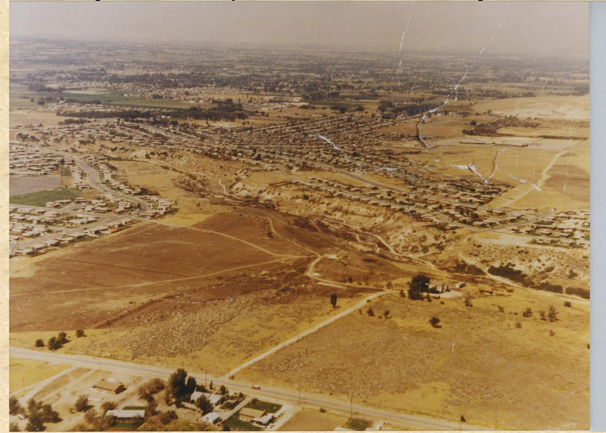
Aerial photo of White City 1962. Glad Home south of Dimple Dell Park.